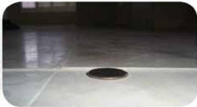
LIPPAGE (UNEVEN TILES)