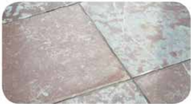
DIRTY, STAINED GROUT LINES