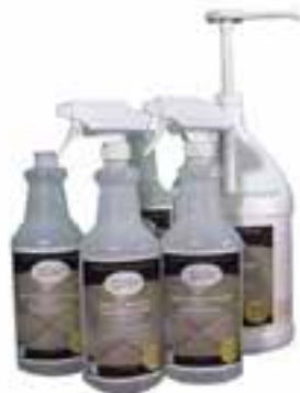
TILE & GROUT